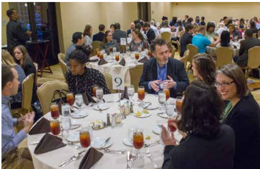
Law Student Mentoring Lunch, New Orleans, LA