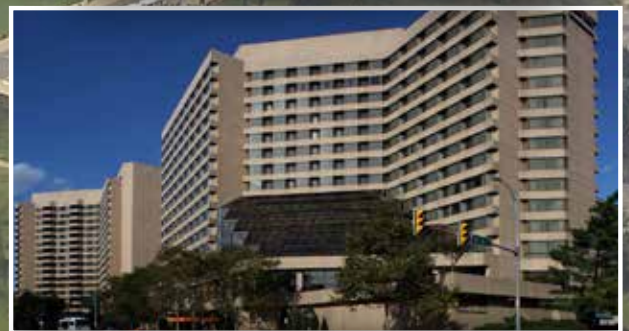
CRYSTAL GATEWAY MARRIOTT - ARLINGTON VA